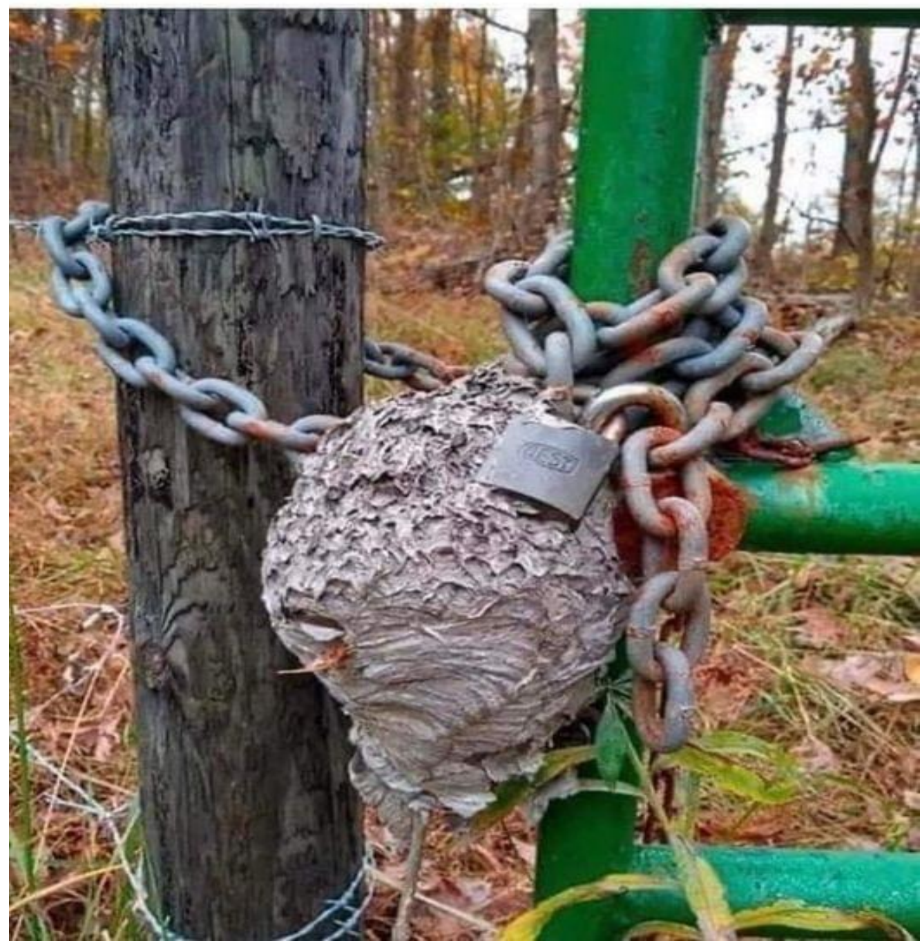
Just installed my new gate security system

MarkParisi@aol.com 3-23 ©2011 Mark Parisi Dist. by Universal Uclick